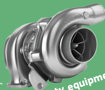
Heavy duty equipment