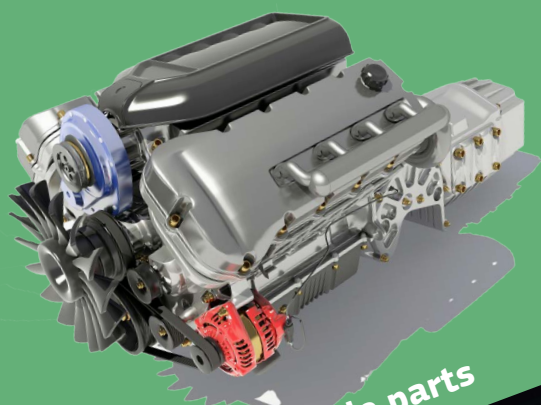
Motor vehicle parts

As a contribution to the G7 Alliance on Resource Efficiency 7-8 February 2017 Brussels, Belgium