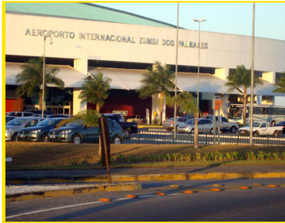
ZUMBI DOS PALMARES - INTERNATIONAL AIRPORT OF MACEIÓ CITY, homage to a historic rebel, and today a National Hero