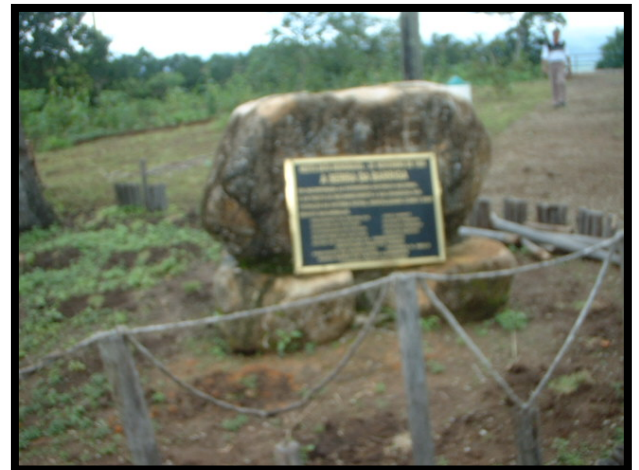
(1) Rural road to the Serra da Barriga ridge. (2) The Village, former commercial exchange point between farmers, and Palmares settlers. (3) Pottery woman, Palmares descendant. (4) Pottery for selling at handcraft markets in Maceió city. (5) View at the Serra da Barriga . (6) National symbol for Zumbi.