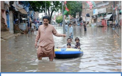
Torrential rains flood Hyderabad, bring life to standstill, Dawn, 24 Aug 2022

Changes in precipitation patterns are evident across the globe. Some regions experience more intense and frequent rainfall leading to flooding, while others face reduced rainfall resulting in prolonged droughts. These changes impact water supply, agriculture, and natural ecosystems. For example, the Mediterranean region is seeing increasingly dry conditions, whereas parts of South Asia and the eastern United States are experiencing heavier rainfall events.