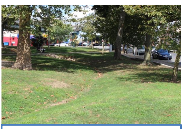
A swale is a grassy depression that controls stormwater velocity and infiltrates runoff where feasible. Swales are typically used to channel stormwater from a street or sidewalk to a rain garden or basin.