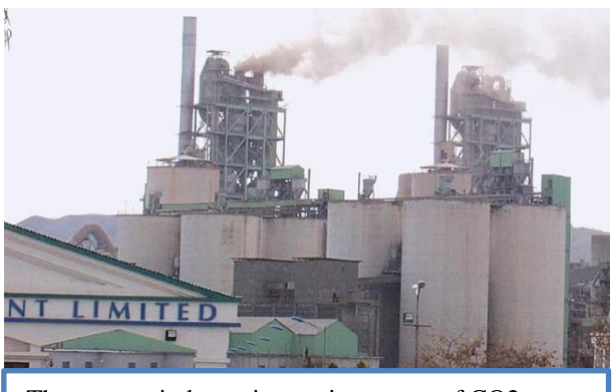
The cement industry is a major source of CO2 emissions.