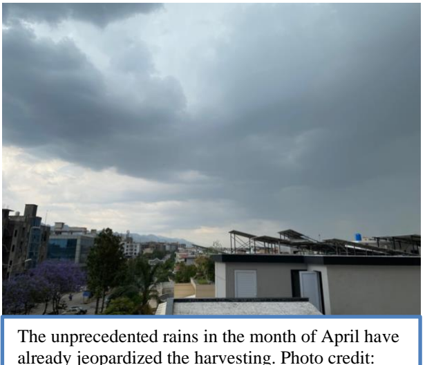
already jeopardized the harvesting. Photo credit: Amer Ejaz, taken on 27 April 2024

acidity, affecting marine life and coral reefs. Additionally, melting ice caps and glaciers contribute to rising sea levels, threatening coastal communities and ecosystems.