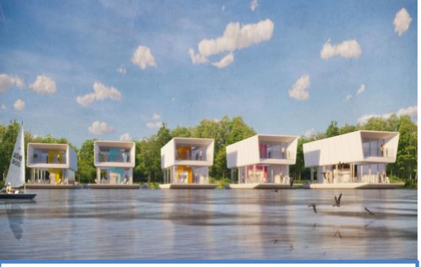
To protect people living in areas prone to flooding and rising sea, this project is designed by a British architect firm Grimshaw, and a Dutch manufacturer Concrete Valley.

Examples include floating houses, flood-resistant roads, and materials that can better withstand high temperatures and severe storms.