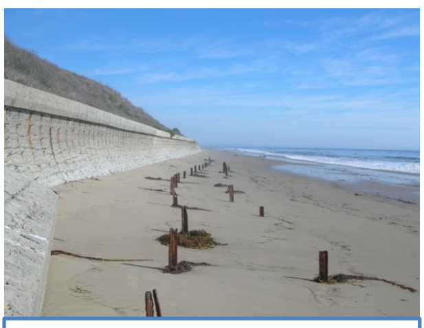
A sea wall at Arroyo Quemado beach in California.

• Resource Availability: Different communities have varying levels of