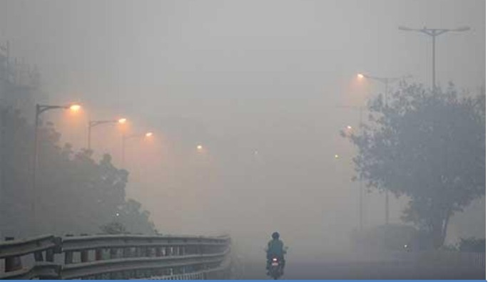
"Smog engulfs Lahore with complete silence from corridors of power." One possible solution is a comprehensive, omnipresent, and reliable public transport system that can offset the effect of private vehicles on the road.

diesel, although electrification and alternative fuels are beginning to make inroads.