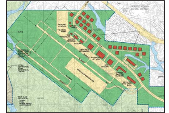
Airport and Airport Park Development

The initiative therefore creates a new model for public - private sector participation, while creating jobs and improving the quality of life of its inhabitants and those in the surrounding areas.