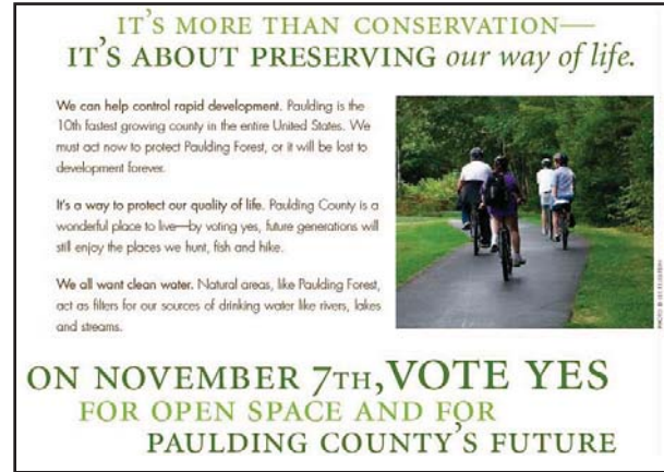
The Paulding Forest Initiative