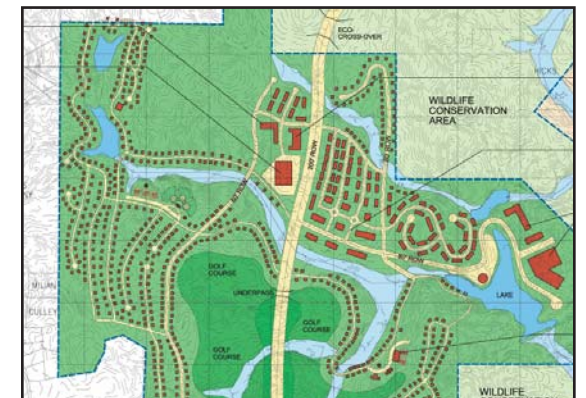
Lake Focused Cluster